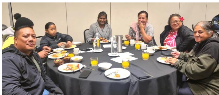
Above: SPS support staff enjoying a special breakfast, back in May, celebrating Support Staff Day.

This is a friendly reminder for all our parents and caregivers who drop off and pick up their children near the school. You need to find a safe space to stop to drop off your children. You cannot stop just anywhere and let your children out, when they cannot see any oncoming traffic. We are observing this in the mornings, especially when children hop out of their cars and just cross the road without checking for traffic. This could end up in a devastating accident. Parents, this is your responsibility, I cannot emphasise this enough. Please, your child/ren's safety is very important to us all.