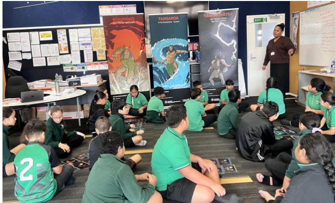
Aorangi Syndicate students engaged in their Kia Rite Kia Mau session first thing this morning.

Tē tōia, tē haumatia, Kia rite, kia mau, (Nothing can be achieved without a plan, workforce and a way of doing things, be prepared, to take action).