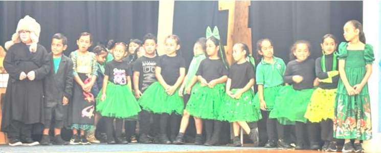
Above: R5 performed "Ko Siaki mo e fu'u piini" – (Jack and the Beanstalk).

There was a wonderful showcase put on by the Sia Ua unit last Friday. Each of the classes performed a Tongan drama mostly based on stories from Tonga. Once again, thank you to our parents for your continuous support.