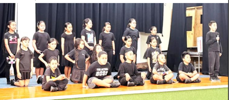
Above: R6 performing a poem about sea creatures, with song and fun actions "Koe maau Toki Tumu 'la Paka"

Below: Rumaki 1 performing at the Moana Syndicate Assembly yesterday.