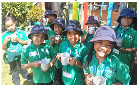
Above: R5 enjoyed drinking kawakawa tea at the Zero Waste Trip on Monday.

This is an important trip for all our students to attend. This is one part of the Science curriculum that our students will need to know. It is a great opportunity for all our students to reconnect with the principles of reducing, reusing and recycling. The skills learnt during their visit to the Zero Waste facility can also be used at home with the recycling bins as we are becoming more aware of what sorts of rubbish causes damage to our environment. Our first set of classes went yesterday and the feedback I got from the parents was positive. I need to acknowledge and thank the parents who have made themselves available to go on the trip to support our students at Zero Waste. This is important for our partnership with the school and the community.