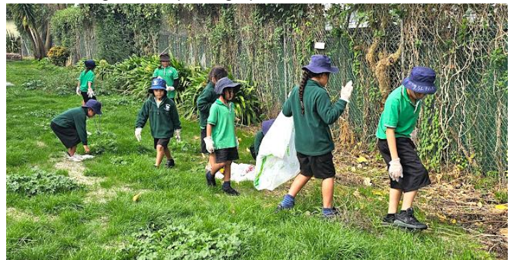
Above is the Rumaki Reo out with their gloves, rubbish sacks, and sunhats, tidying up around the school fence line.

Yesterday various classes went about the local community and school grounds, picking up litter.