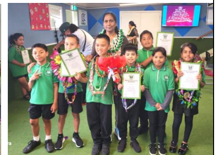
Above: R24 prizegiving winners