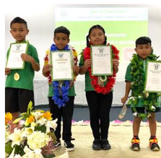
Above: R14 prize winners