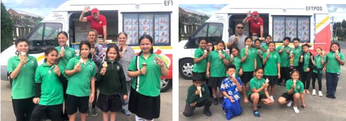
R3 (Last week treat winners.) R25

Whenua: R5 85% and R4 84% Moana: R6B 92% and R17 89% Aorangi: R7 88% and R16 90% Atea: R10 89% and R8 85%