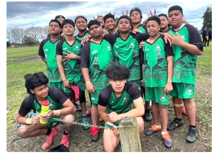
Above: The Y7&8 boys' league team came 2<sup>nd</sup> in their pool games.

Make a booking Event Code : 4x43a Or contact the school office or your child's teacher