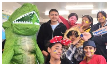
Above: R11 students as book characters