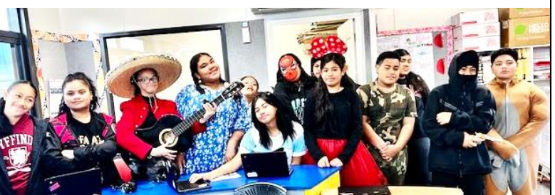
Above: Students in R11A dressed up as book characters on the last day of Term 2.

If your child is involved, you are most welcome to come.