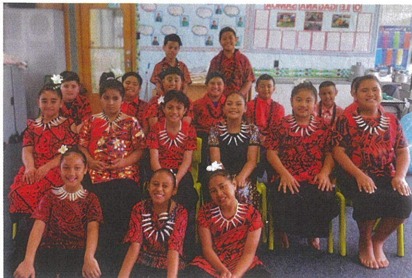
Above: : Room 17A waiting to perform at the Cultural Extravaganza on Friday 9 th December.

Be advised that Friday 16 December is our last day for 2022. The school closes at 1:00pm this day.