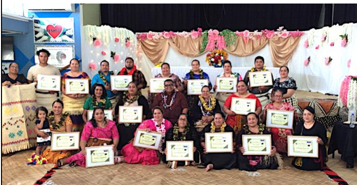
Above: Tongan Talanoa Ako Tongan Graduation 2022