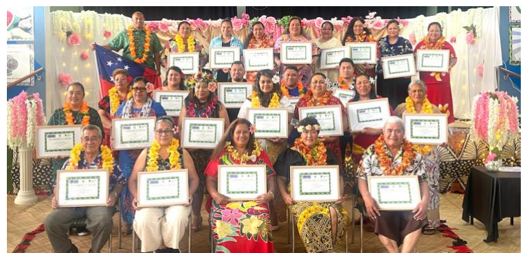
Above: Samoan Talanoa Ako Graduation 2022

Whenua (Years 1-2): R13A (93%) Moana (Years 3-4): R6 (92%) Aorangi (Years 5-6): R9A (95%) Atea (Years 7-8): R10 (90%)