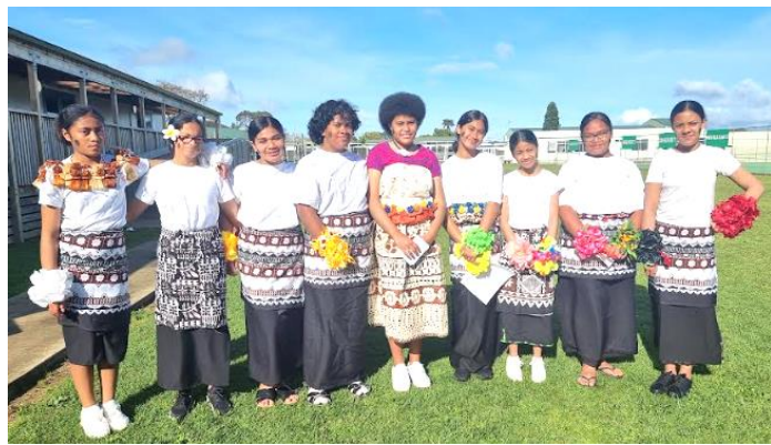
Above: Students dressed for Fijian Language Week today.

There is no vacancy in both Sia Ua and Masina Va'aia for Years 7-8 this year. The intermediate roll in both the Tongan and Samoa bilingual units is full. There is only space in Years 1-6.