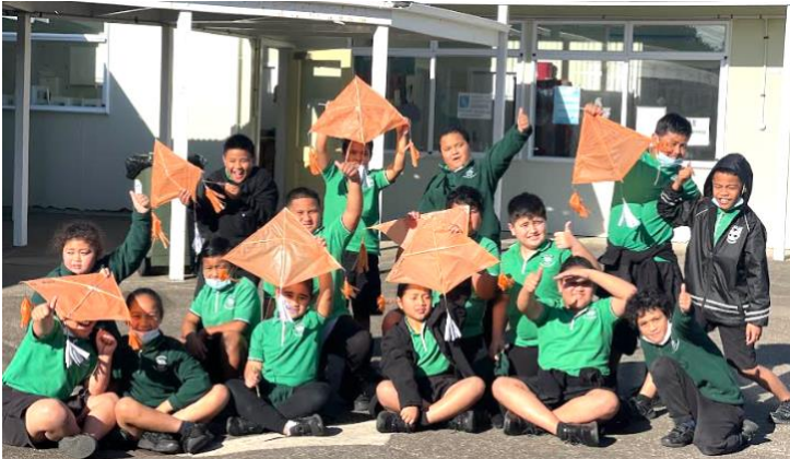
Above: R17 & 17A with their kites last Thursday.

Dreams without actions can be discouraging. The establishment of habits and discipline can go a long way into making dreams a reality. Children are asked to select one or two habits that they need to establish that can lead to their dreams being fulfilled.