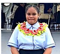
2 nd 'Ana R8