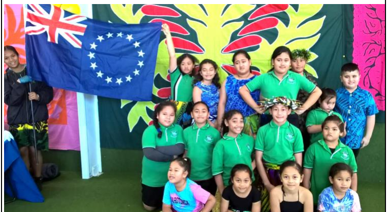
Above: Students during their Cook Island Language Week programme.

Parking - please do not park on the yellow lines , they are there for a reason and that is the safety of our children. We have had complaints from neighbours that cars are blocking their entrance ways so please find legal, safe street parking to avoid any obstructions to our neighbours.