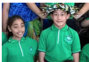
Above: Riana R21 and Felili-Wiki R16 enjoying Cook Islands Language Week

Term 3 Dates to add to your diary or calendar. Please join us when you can.