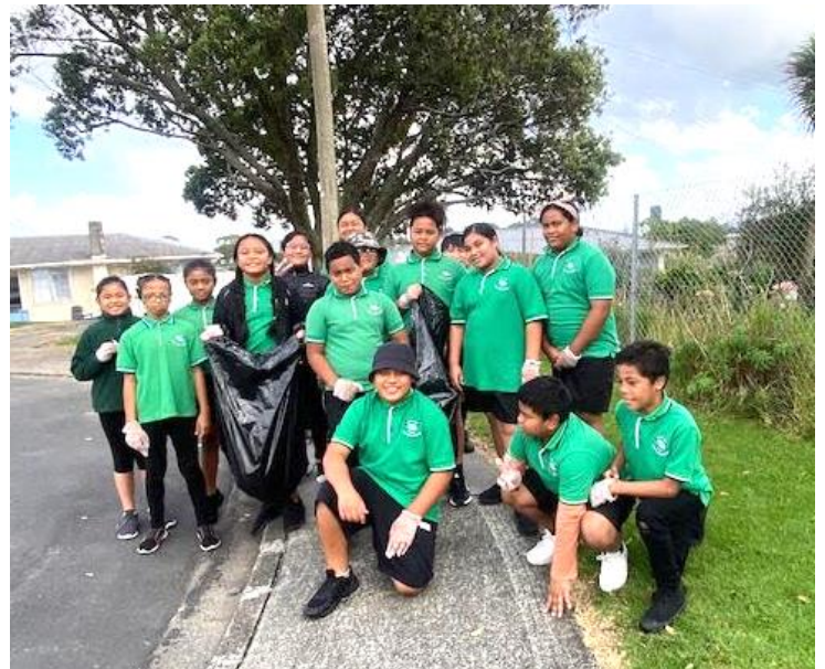
Above and left: Students during the school community clean-up, earlier in the year.

Parking - please do not park on the yellow lines , they are there for a reason and that is the safety of our children. We have had complaints from neighbours that cars are blocking their entrance ways so please find legal, safe street parking to avoid any obstructions to our neighbours.