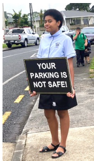
Above: Nissi R11

Thank you for respecting our attempts to keep our students safe. Our Travelwise Student Leaders commented that many of you were very supportive and co-operative. One of our priority goals is that our school is safe for all our students. Please be mindful that some of our little ones are NOT always attentive around the roadside.