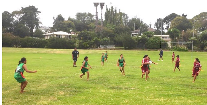
Above: The girl's Rippa Rugby team in action against Fairburn Rd School.