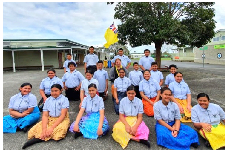
Above: R15 celebrate Niuean Language Week