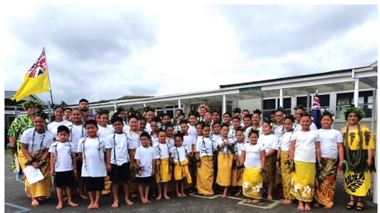
Below: Many students wearing yellow and white to celebrate Niuean Language Week